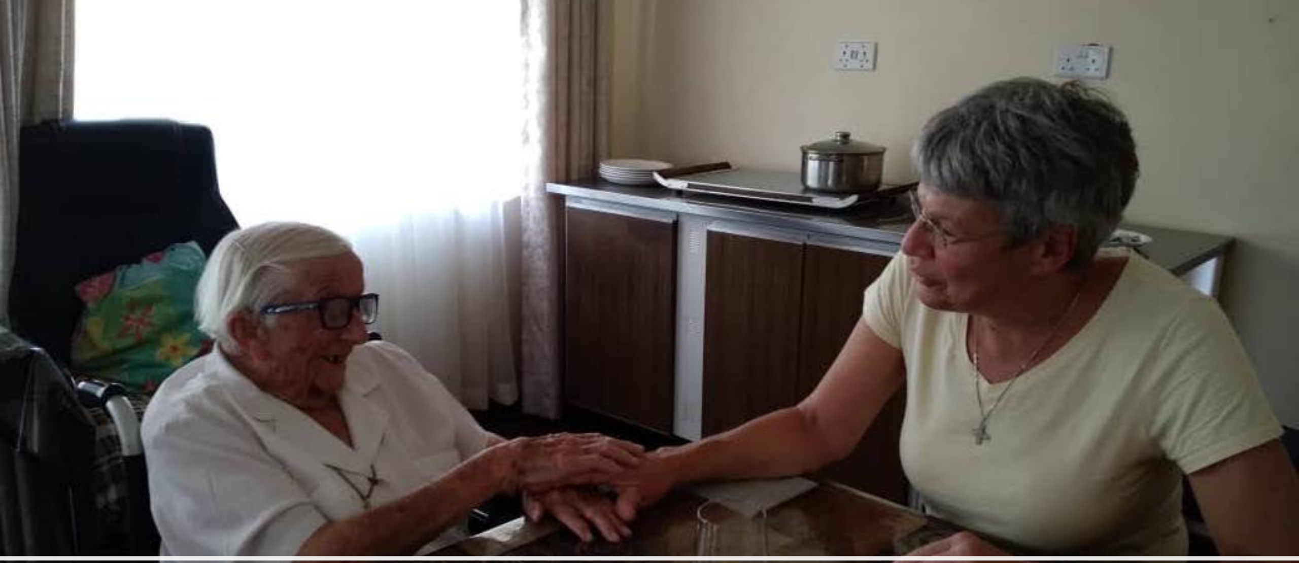
In the dining room at Chishawaha